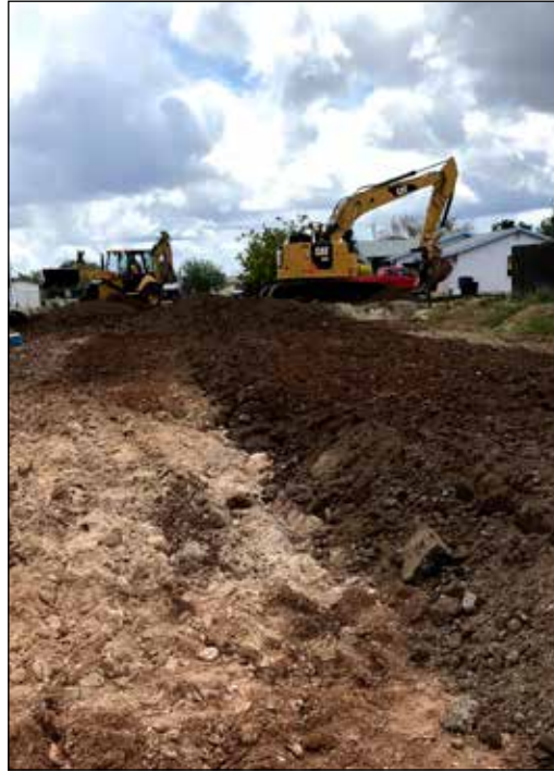
Sunset Lane Improvement Project

Drivers are asked to use extra caution and observe speed limits while traveling detours through these residential neighborhoods as the project continues.